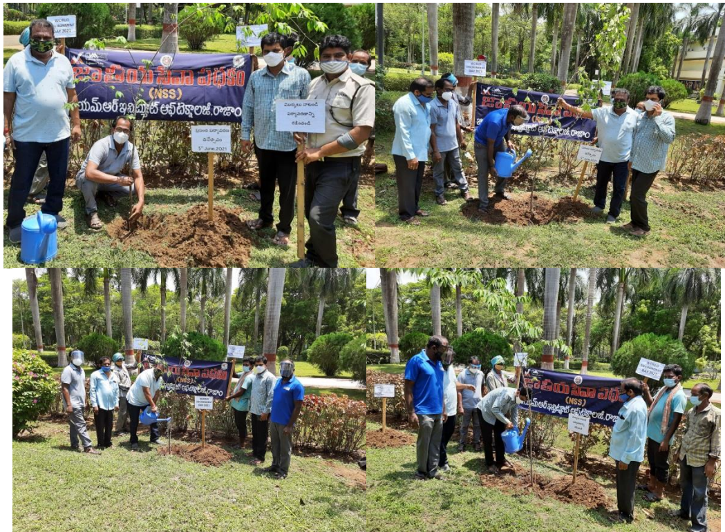
05-06-2021 Organized Plantation programme in connection with World Environment Day